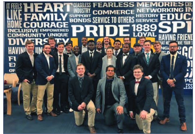
Brothers and new pledges pose at the pledge badge ceremony.