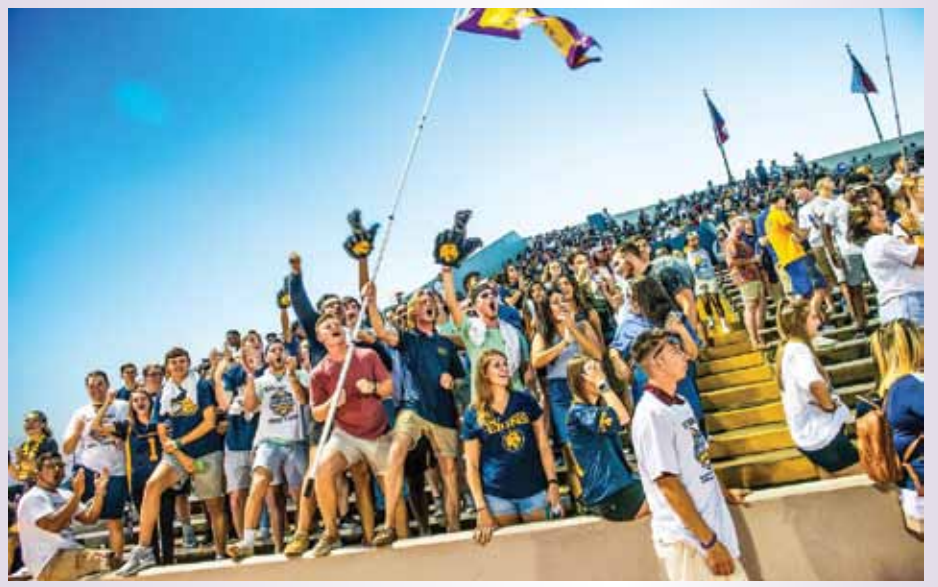
Delts proudly supporting the Lions football team.