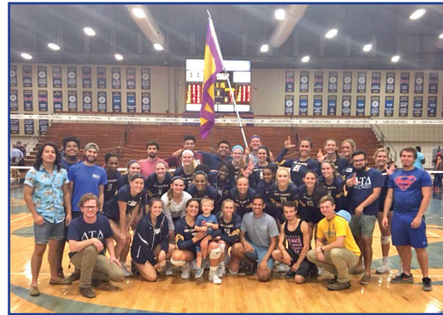
Brothers with volleyball women.