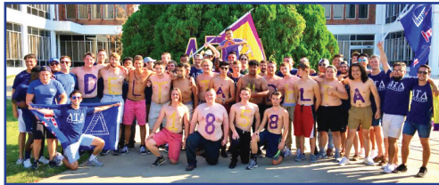
Fall '17 rush class.