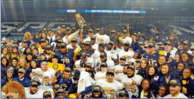
The Lions celebrate National Championship.

After an expanded bracket this year, the Lions are the first ever NCAA team to win five playoff games on the way to a football championship. The first three games were played on the road in Minnesota, Central Washington, and back to Minnesota, beating three teams that had a combined record of 34-1. The Lions then returned to Commerce, beating Harding University (Searcy, Arkansas) at home, 31-17, in front of a stadium-record crowd of 10,120 fans. The Lions are now the reigning Division II National Champions!!!