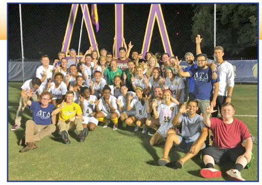
Brothers with soccer women.

we almost beat the former A&M - Commerce Ultimate team. As for our academics, we're always pushing higher, looking to increase the lead we have in first for our accumulative GPA. We had an incredibly fun and successful JDRF Walk this year after getting multiple compliments. We showed those who run the Walk that we at Epsilon Eta provide the fire and enthusiasm to get others involved in little activities that they provided. After such an awesome turnout this past semester and me moving to the CEO of the organization, we've also decided to add a bi-annual philanthropy called "Be The Match." This philanthropy helps find matches to help find cures for those who are suffering from leukemia and other blood cancers. We have a lot in store for this chapter and we're always