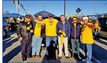
EH Delts tailgate in Kansas City before the Lions National Championship.