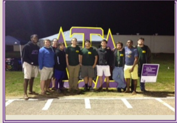
Undergraduate members at Relay for Life

The last bit of news is our academics. Epsilon Eta has enacted a totally