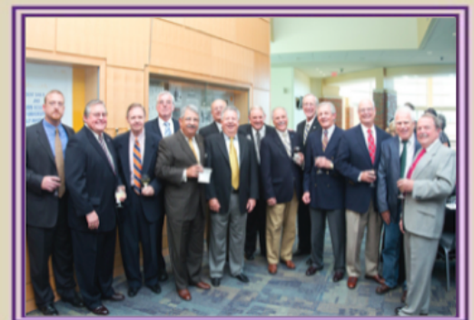
'60s Brothers at the Award Presentation