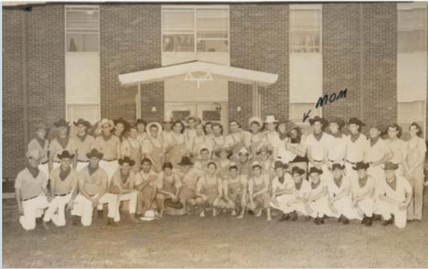
Kappa Delta Sing Song 1966-1967