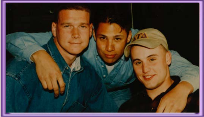
A few brothers from the early 90's

Brotherhood throughout the 90's and 00's