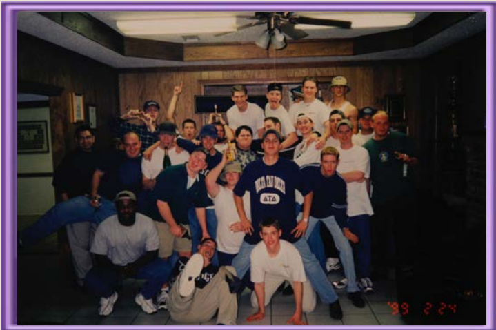
Brothers in the great room in the late 90's