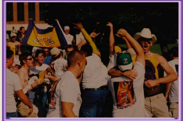
Running of the hill - Early 2000's