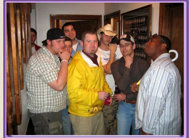
Brothers at the 45th Anniversary