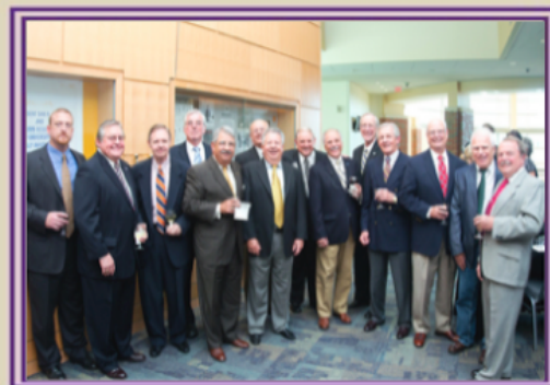
'60s Brothers at the Award Presentation